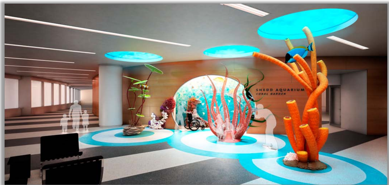
The calming, aquatic themed entrance to the Kenneth and Anne Griffin Emergency Care Center